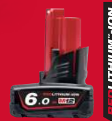
REDLITHIUM-ION BATTERY PACK