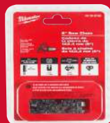
152MM (6") SAW CHAIN 49-16-2732