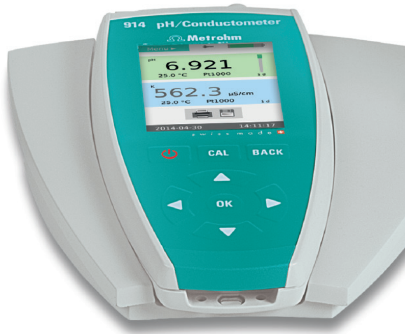
914 pH/Conductometer – measuring pH value and conductivity simultaneously