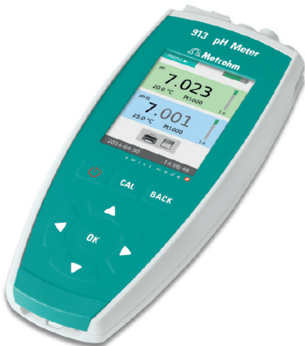
913 pH Meter – measuring two pH values simultaneously

Whether outside in the field or in the process: Do measurements in several locations and save the results with the press of a key. You can print out the collected data or read it out to the PC in your office or laboratory to manage it in tiBase or export it to your LIMS/Excel.