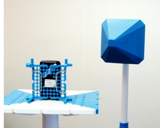
The MegiQ RMS-0740 measures TRP

This implies a radiated sensitivity measurement and seemingly points us back to the test lab with calibrated and anechoic test setups. There is however a method that uses the receiver RSSI and does not require a calibrated radiated signal path for the sensitivity measurements.