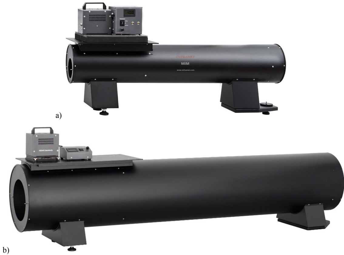
Fig. 1. Photos of two MIM test systems: a)MIM110, b)MIM300