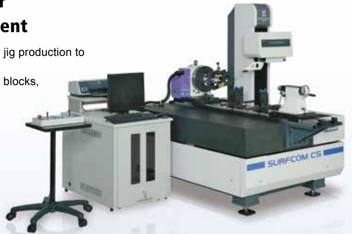
Example for crankshaft

Basic specifications are Type-C (mainly for cylinder heads, cylinder blocks, and other workpieces where a 5-direction approach is required) and Type-S (for camshafts and other shaft workpieces that require a rotary axis).